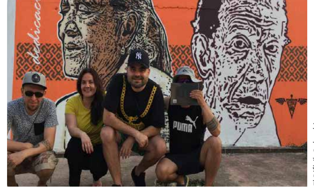
El Difícil, Colombia