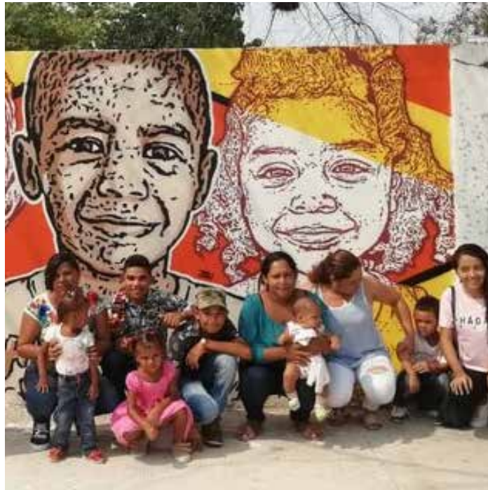
San Angel, Colombia